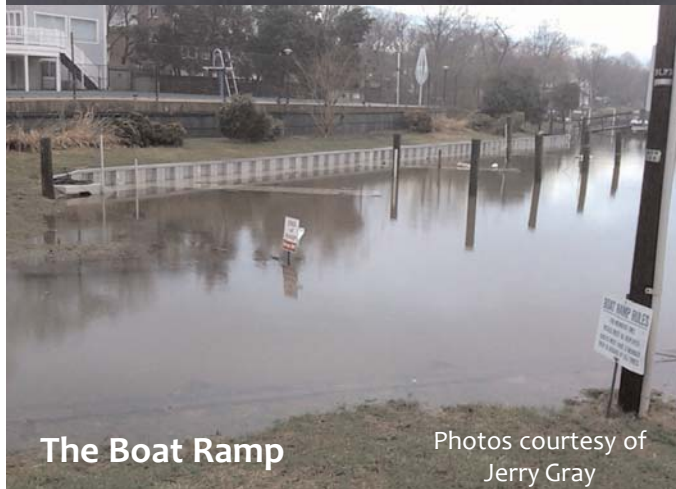
The Boat Ramp