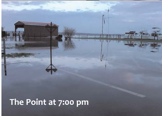
The Point at 7:00 pm